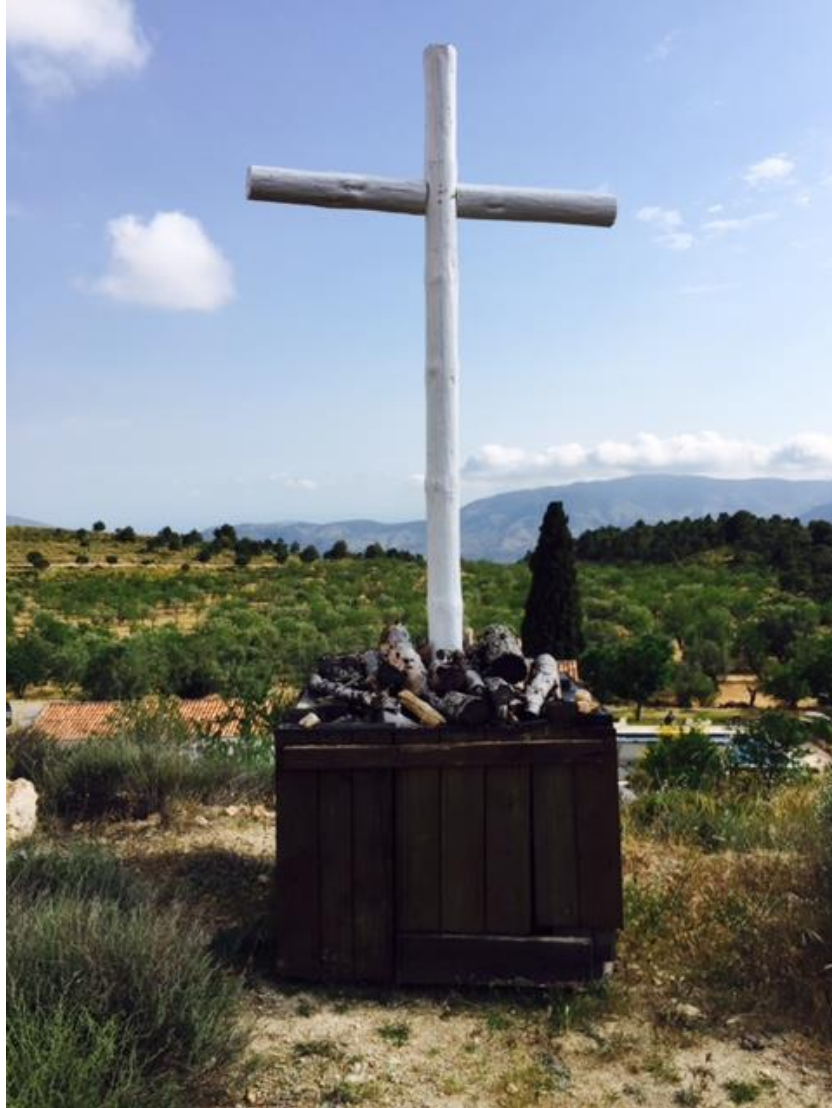
The Cross at Los Olivos